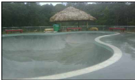
New Skatepark & Eagle Scout Tiki Hut Project

Broadcast audio of City Commission meetings over the internet enabling more citizen access to current Commission activities & decisions.