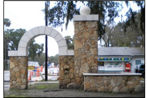
West Canal Streetscape Project

The West Canal Streetscape and Drainage Improvements Project - Construction was initiated on this project, which will replace the canal system under the north sidewalk and improve the streetscape through the relocation of overhead power lines, the installation of decorative roadway and pedestrian lighting and the installation of landscaping and pedestrian amenities. The project will be completed in 2010.