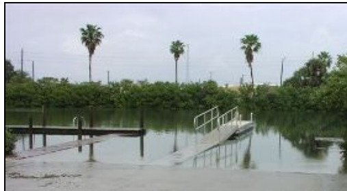
North Causeway Boat Ramps

The boat ramps and gangways have been rebuilt at the North Causeway Boat Ramp facility; work was completed and ramps open to the public October 2009.