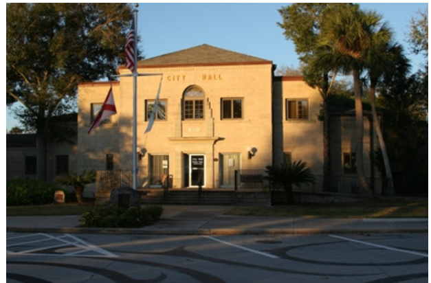
City Hall, 210 Sams Avenue, New Smyrna Beach

and/or ongoing capital projects throughout the City. We would like to keep you informed so that you will know when to expect changes in your neighborhood, such as road closures, detours, etc. We hope you will find the articles and information enlightening, and we will strive to keep it informative.